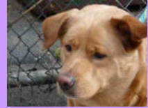
Cindy Large, Adult, Female Golden Retriever/ Chow Mix

majority of a cat's prey is nocturnal as well. Another theory is that house cats simply don't get enough exercise during they day since they don't have to hunt for their meal. All their pent up energy finally expresses itself in these frenzied moments. Other specialists believe it revolves around the schedule of the cat's owner. When a cat is left at home alone during the day, it becomes bored. When his or her owner comes home from work in the evening, the cat wants to play and therefore becomes overly active. Regardless of motive, I was more than happy to discover that my cat wasn't going completely insane.