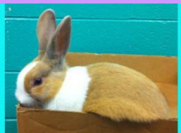
Nugget Bunny young male medium haired rabbit