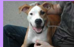
Cash Medium, Baby Male Pit BULL