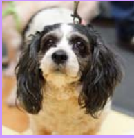
VIE Senior female dog Cavalier King Charles spaniel/ poodle mix