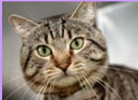
PATRICIO young male cat medium hair