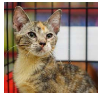
ADOPTABLE! Sherry Baby Female Domestic Short Hair

Zani's and other conscientious adoption and rescue organizations also take the time to learn the personalities of each individual pet. By doing so, they are better equipped to place pets with like-minded prospective adopters again reducing the number of returned animals who are not compatible with their owners' lifestyles. The more involved an organization is in the lives of its animals, the better suited they are to determining which animals will make a good fit with prospective adopters.