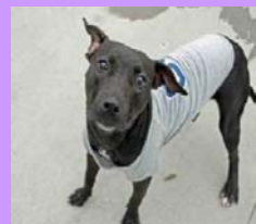
Patrola Large, young, Female Labrador Mix