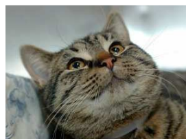
JOSH DOMESTIC SHORTHAIR MEDIUM, YOUNG, MALE