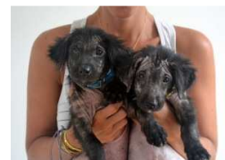
THEO & SMIT LABRADOR/ COLLIE MIX MEDIUM, BABY, MALES