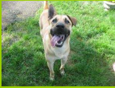
BUDDY GERMAN SHEPHERD MIX MEDIUM, YOUNG, MALE