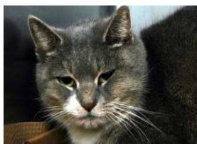
ANDREA AMERICAN SHORTHAIR MEDIUM, YOUNG, FEMALE