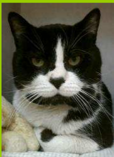
KING KONG TUXEDO LARGE, YOUNG, MALE