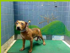
BABY OZZY AST/PIT BULL MIX MEDIUM, BABY, MALE