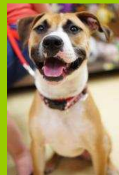
AURIA AST/COLLIE MIX MEDIUM, YOUNG, FEMALE