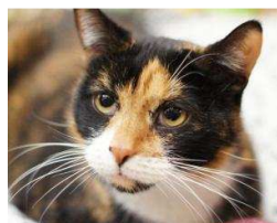
JENNY DOMESTIC SHORTHAIR/ TORTIE MIX MEDIUM, YOUNG, FEMALE