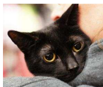
CHLOE BOMBAY/ DOMESTIC SHORTHAIR SMALL, YOUNG, FEMALE