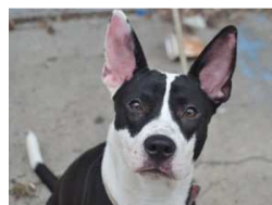
DEXTER PIT BULL/BASENJI MIX MEDIUM, YOUNG, MALE