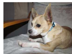
CHOY CHI CHI CHIHUAHUA SMALL, ADULT, MALE