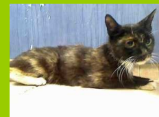
HOPE DOMESTIC SHORTHAIR SMALL, ADULT, FEMALE