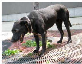
BOY BLACK LAB MIX MEDIUM, YOUNG, MALE