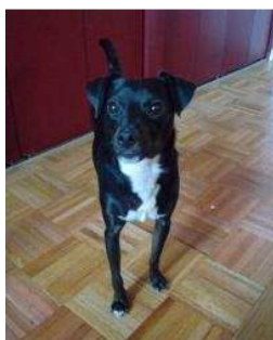
MARCO TERRIER/ITALIAN GREYHOUND MIX SMALL, YOUNG, MALE