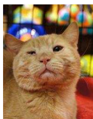
DUCKY DOMESTIC MEDIUM ORANGE SHORTHAIR MEDIUM, ADULT, MALE