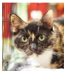
ISABEL DOMESTIC SHORTHAIR MEDIUM, ADULT, FEMALE