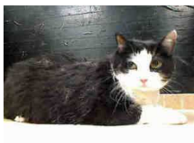
LADY BIG KITTYKAT BRITISH SHORTHAIR LARGE, ADULT, FEMALE