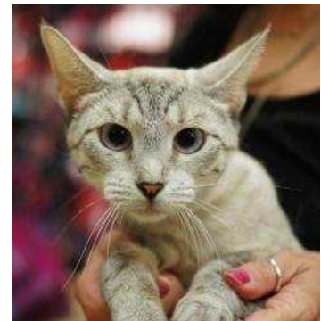
MONIQUE SIAMESE/DOMESTIC SHORTHAIR MEDIUM, YOUNG, FEMALE

Check to make sure your pet's tags are up-to-date with current information. You might even want to consider getting your pet microchipped since animals frequently become separated from their owners while traveling. Carry a current photo and description of your animal, just in case you do become separated. Also, check that your carrier is appropriate for your animal. While certain airlines have specific instructions about what size crates they should also provide enough room for your pet to move around, have a securely locking gate, have sturdy handles on the outside, and lack any protruding pieces so your pet doesn't injure themselves. Be sure to write your contact info in large print on the outside of the crate just in case- and NEVER put a leash in the crate. Your pet could get tangled up!