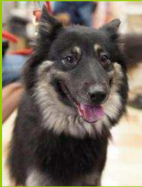
FOXY COLLIE/ SHEPHERD MIX MEDIUM, ADULT, FEMALE