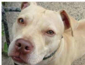
PERLA AST/BOXER MIX MEDIUM, YOUNG, FEMALE