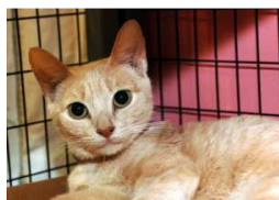
GOLDIE DOMESTIC SHORTHAIR SMALL, YOUNG, FEMALE