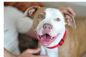
KELLY AST MEDIUM, YOUNG, FEMALE