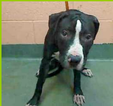
STELLA PIT BULL TERRIER MEDIUM, YOUNG, FEMALE