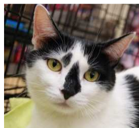
KISSES DOMESTIC SHORTHAIR MEDIUM, BABY, FEMALE