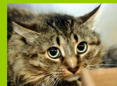
FLUFFY MAINE COON MIX SMALL, YOUNG, FEMALE