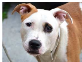
CHARLIE AST/PIT BULL TERRIER MIX MEDIUM, YOUNG, FEMALE