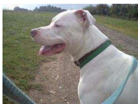
BRYAN PIT BULL MEDIUM, YOUNG, MALE