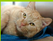
KITTY DOMESTIC ORANGE SHORTHAIR MEDIUM, YOUNG, FEMALE